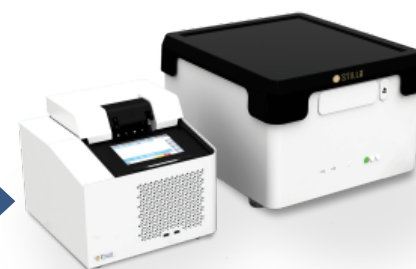
dPCR and data collection

Data analysis with Atila iSAFE™ NIPT Software