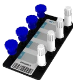
Load the Sapphire Chip