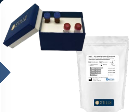
PCR reaction assembly